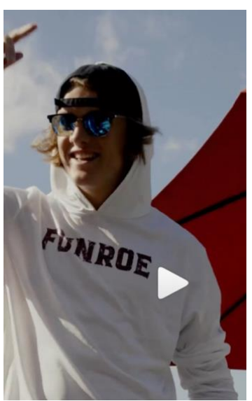
"Click" each photo above to experience moments at the nationals. Below: team photo at Fri. night boosters social. See below, current team and alum at Friday night social.