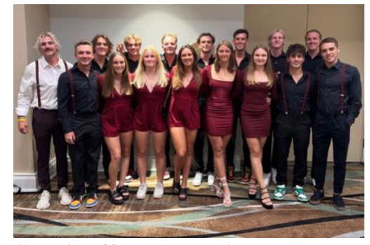
See details on page 2.