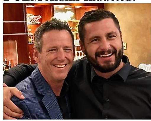
See details on page 3.