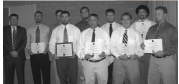
AGC Scholarships Recipients