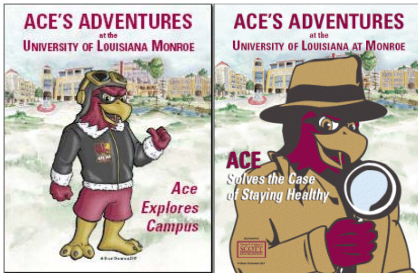
Author of Ace’s Adventures “Ace Explores Campus” and “Ace Solves the Case of Staying Healthy”