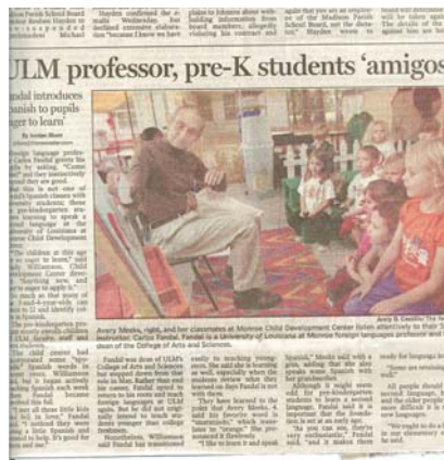
News Star Front Page October 12, 2006

Campus wide recycling program for ink, laser jet cartridges, and used cell phones.