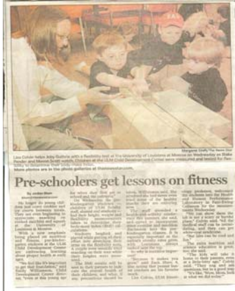
News Star Front Page of Local Section October 5, 2006

Positive Articles have been published in the News Star World about two of these Campus Collaborations.