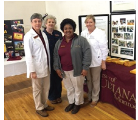
Browse on the Bayou, Fall 2016