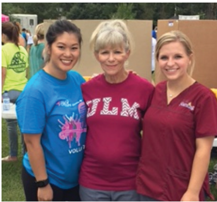
Susan G. Komen, Fall 2016