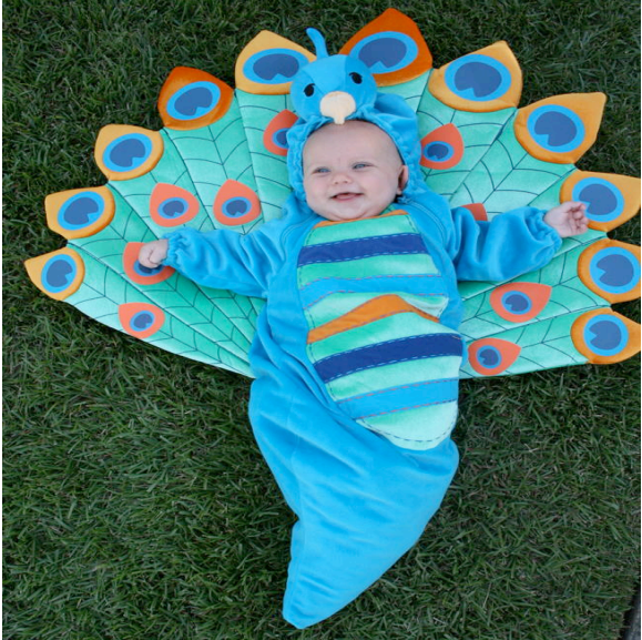
The CQI Connection, No. 78, October 20, 2010 ULM College of Pharmacy