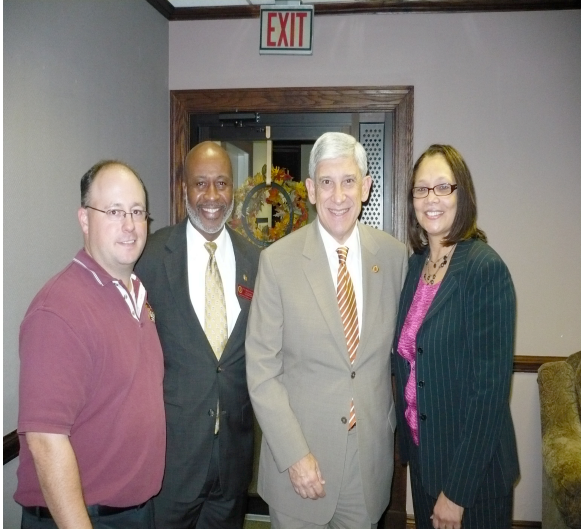
The CQI Connection, No. 80, November 17, 2010 ULM College of Pharmacy