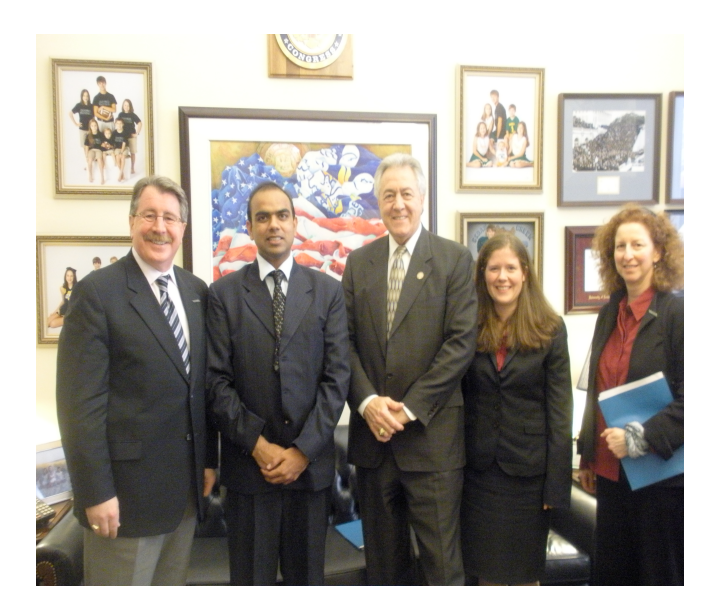
The CQI Connection, No. 84, March 2011 ULM College of Pharmacy

Staying connected through continuous quality improvement