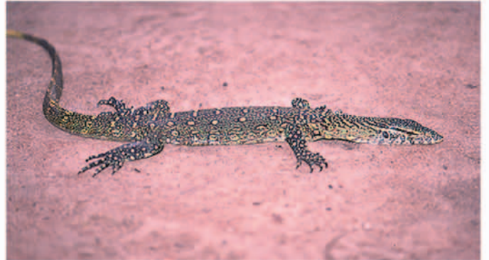
Fig. 15. Varanus niloticus (KU 291925) collected 5 km E Somoria, Mafou forest.