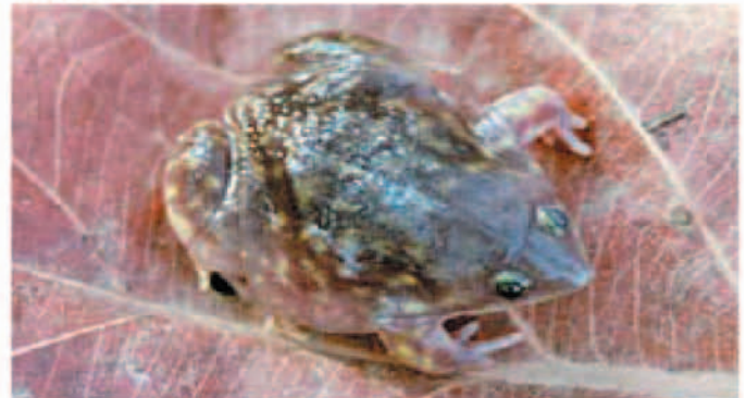
Fig. 5. Hemisus marmoratus (NLU 70622) adult female, collected on a road at Diaragbèla.