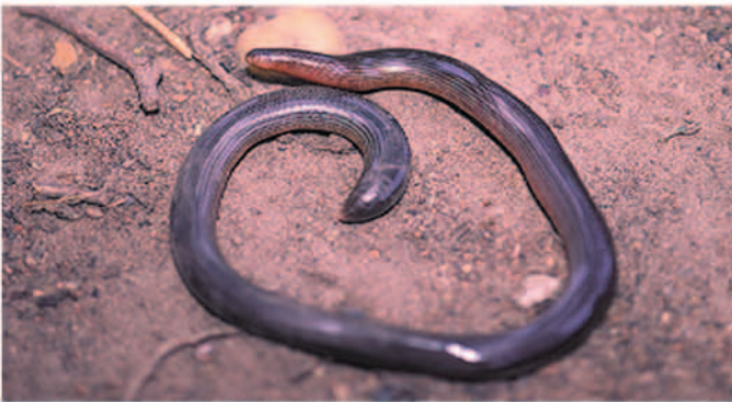
Fig. 16. Typhlops punctatus (NLU 70569) collected in a pitfall trap, gallery forest adjacent to Kofing River.