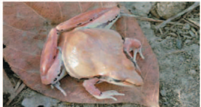
Fig. 9. Ptychadena tellinii (NLU 70625) adult female collected on the side of a road at Diaragbèla.