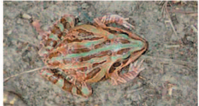
Fig. 7. Hildebrandtia ornata (NLU 70623), adult male collected on a dirt road at Diaragbèla.