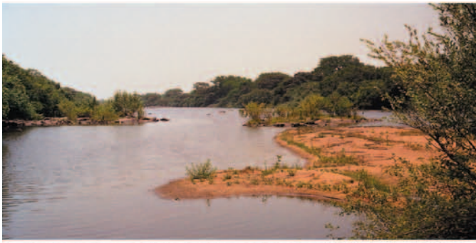
Fig. 2. Major pool in the Niger River looking downstream from the lower end of the run at Somoria.