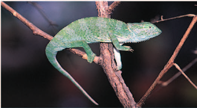
Fig. 12. Chamaeleo gracilis (NLU 70547) collected after falling from a tree in the village of Somoria.