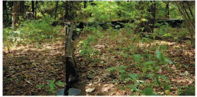
Fig. 3. Drift fence #1 placed in the gallery forest of the Kofing River.