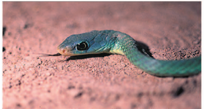
Fig. 17. Philothamnus heterodermus (NLU 70566) collected in a funnel-trap in gallery forest adjacent to Kofing River.