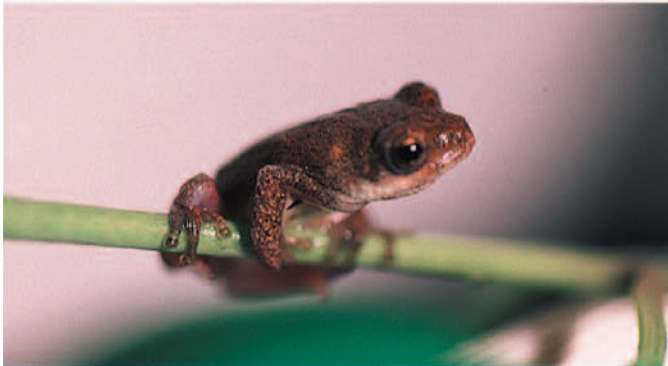
Fig. 6. Hyperolius nitidulus (KU 291900), subadult male collected from damp leaf litter near park headquarters.