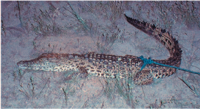
Fig. 10. Crocodylus suchus (KU CT 11915) photographed near Niger River at Mafou Bila.