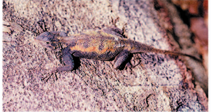
Fig. 11. Agama agama (CNSHB 108) adult female collected on a tree trunk in the village of Somoria.