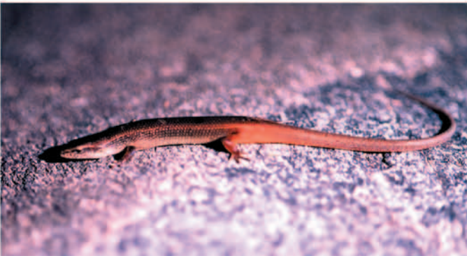
Fig. 14. Leptosiaphos togoensis (KU 291903) collected in gallery-forest leaf litter adjacent to Kofing River.