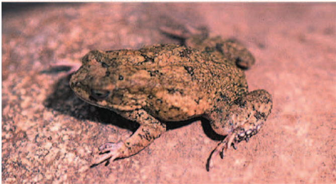
Fig. 4. Bufo maculatus (NLU 70572) adult male, collected as it was calling on the banks of the Niger River, Somoria.