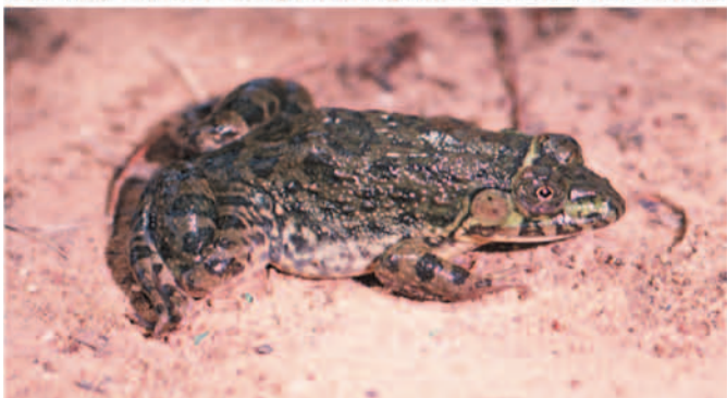
Fig. 8. Hoplobatrachus occipitalis (NLU 70545) collected in shallow pools of the Niger River, Somoria.