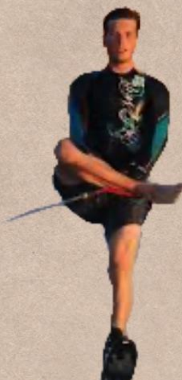
Viktor Motov Russia