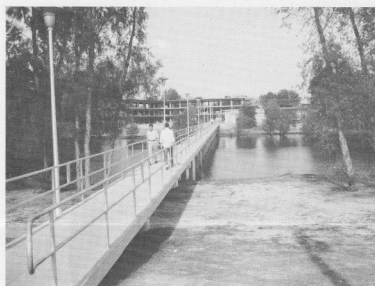
LINKING the original campus of NLSC with the new portion across Bayou DeSiard is this footbridge which was completed a few weeks ago. Constructed of pre-cast concrete, it is 6 feet wide and 460 feet long. The bridge is located at the north end of the campus.