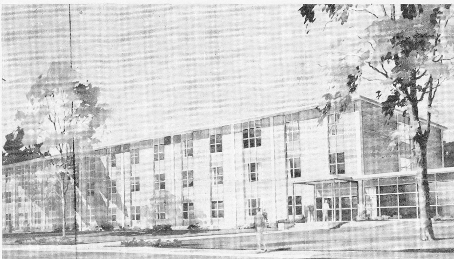
OUACHITA HALL , new air-conditioned dormitory for men, is to be ready for occupancy in September. It will house 152 students in two-room suites connected by baths.