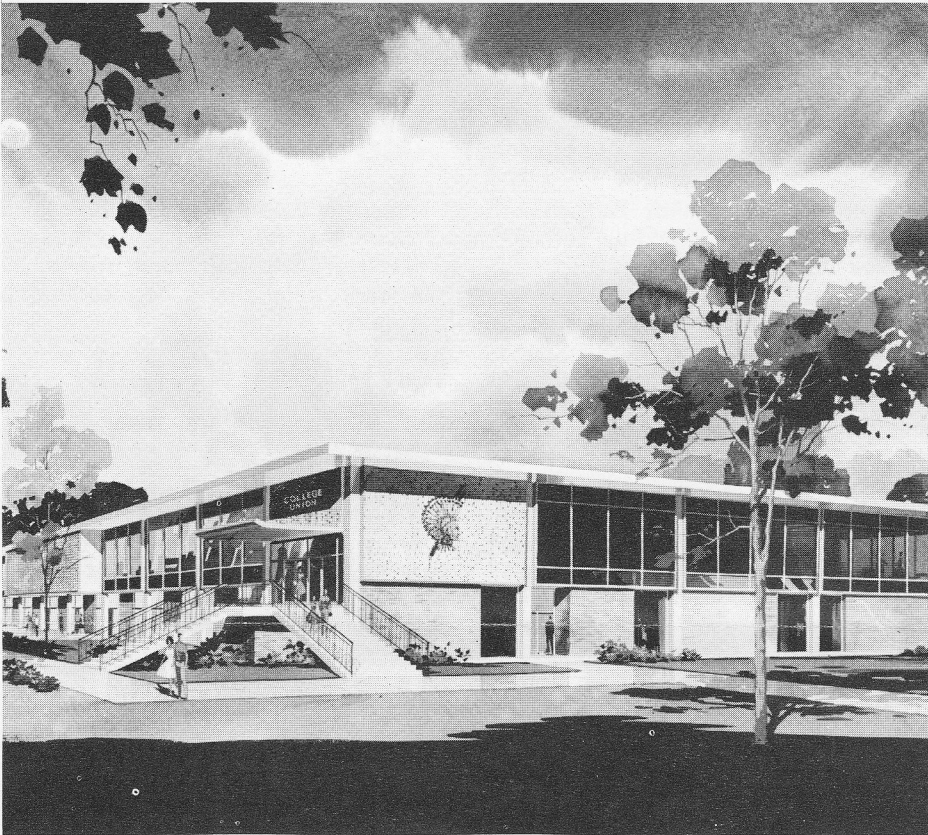
THE COLLEGE UNION BUILDING , slated for completion by the opening of the fall semester, has been called "Louisiana's finest." It will feature a 220-seat theater, eight bowling lanes, a barber shop, beauty parlor and numerous other facilities.