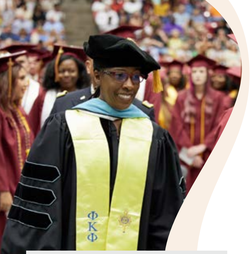
Vice President for Student Affairs