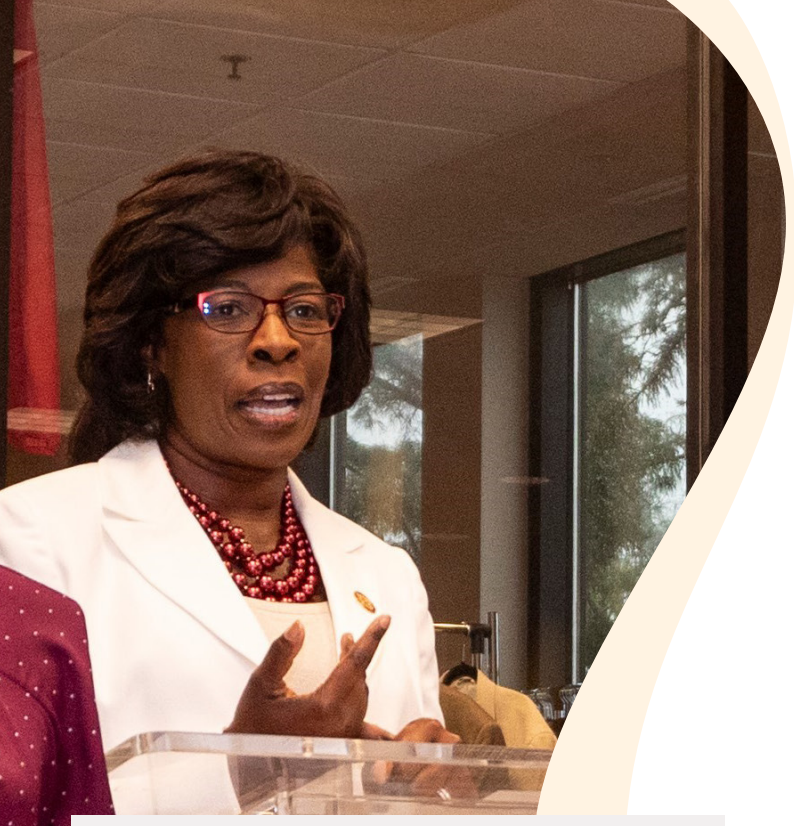
Vice President for Student Affairs